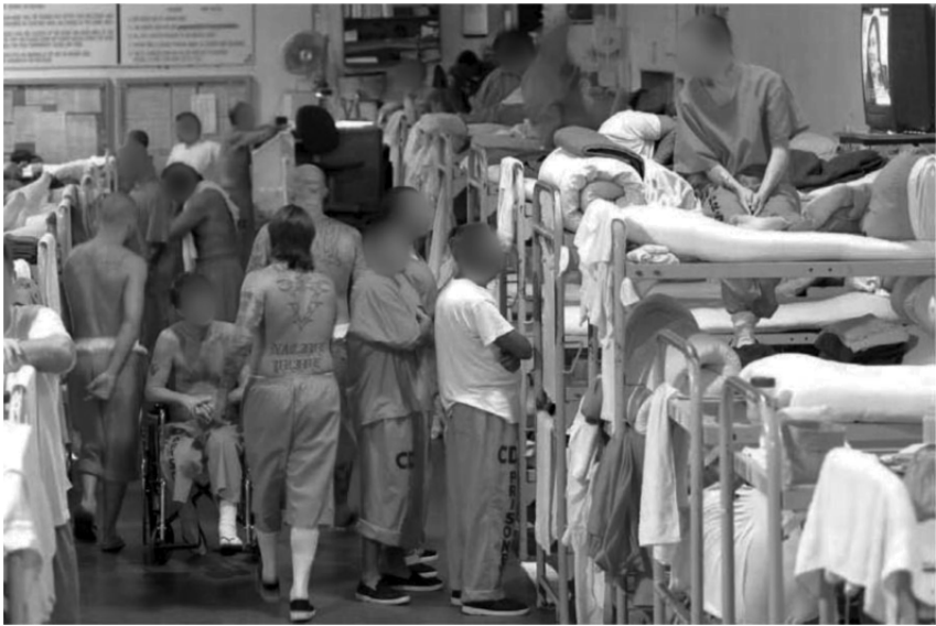
California Institution for Men, Aug. 7, 2006