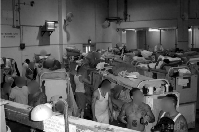
Mule Creek State Prison, Aug. 1, 2008