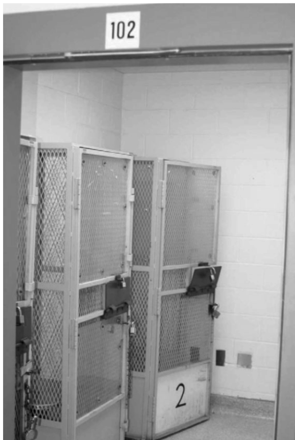
Salinas Valley State Prison, July 29, 2008 Correctional Treatment Center (dry cages/holding cells for people waiting for mental health crisis bed)

The photos appear at the end of Justice Kennedy's opinion, and he refers to them at the beginning of his opinion. Yet, neither the dissent by Justice Scalia 92 (joined by Justice Thomas) nor the dissent by Justice Alito 93 (joined by Chief Justice Roberts) alludes to the photos. No mention of the photos is made in the text of the dissents or in any of their footnotes. The photos function like an exclamation point at the end of